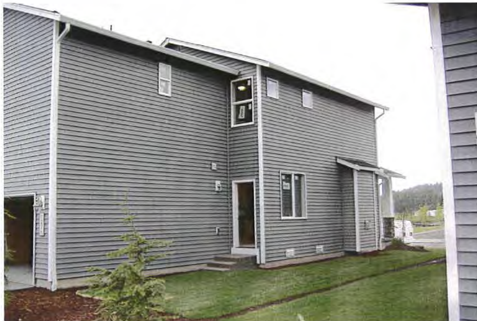
Lot 7 East Face 08-20-08