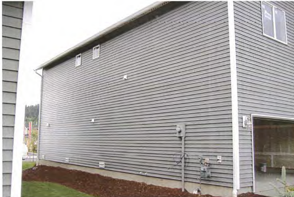
Lot 7 West Face 08-20-08