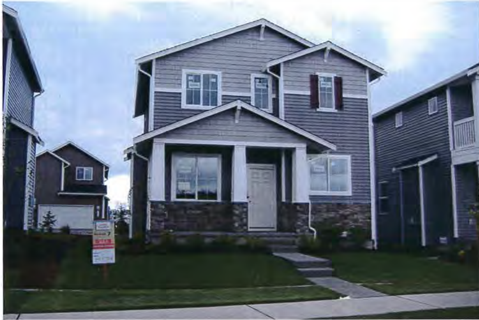
Lot 7 North Face 08-20-08

If using the Elevation Certificate to obtain NFIP flood insurance, affix at least two building photographs below according to the instructions for Item A6. Identify all photographs with: date taken; "Front View" and "Rear View"; and, if required, "Right Side View" and "Left Side View." If submitting more photographs than will fit on this page, use the Continuation Page, following.