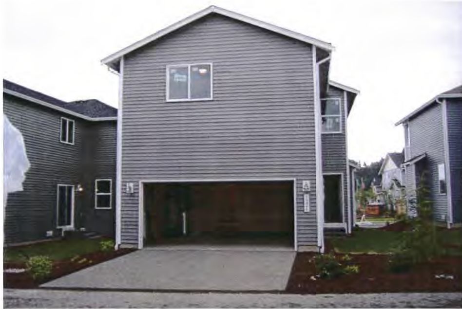
Lot 7 South Face 08-20-08

If submitting more photographs than will fit on the preceding page, affix the additional photographs below. Identify all photographs with: date taken; "Front View" and "Rear View"; and, if required, "Right Side View" and "Left Side View."